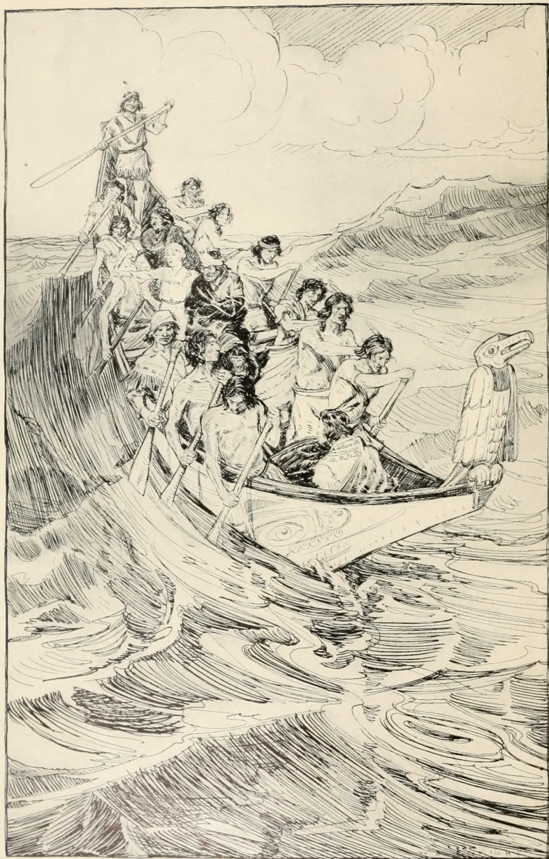
“ Little Ranald, undaunted, swinging from the crest of one long rolling wave deep into the green hollow of another.”